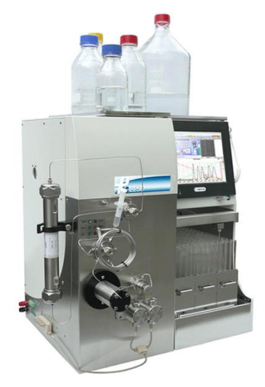
Figure 1. Gilson PLC 2050

Fractionation of Ginger ( Zingiber officinale Rosc.) has identified bioactive components, including the antioxidant 6-gingerol. A crude extract of gingerol was used to demonstrate the capacity of the Gilson PLC 2050 (Personal Liquid Chromatography) system to separate and quantitate compounds with analytical HPLC columns. Method development was first performed on a LaChrom Elite <sup>TM</sup> analytical HPLC system (Hitachi) and then transferred to the Gilson PLC 2050 for chromatographic comparison.