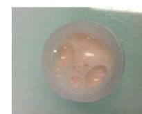
b) After homogenization